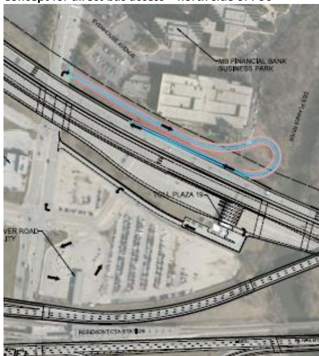
Figure 4 Concept for direct bus access – north side of I-90