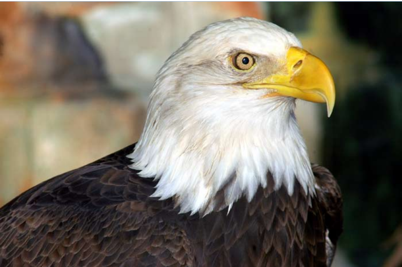
“This photo is of “Freedom”, one of the bald eagles on display at the Phillips Park Zoo in Aurora. It symbolizes how proud we are as a country.”

Planning processes will thoroughly inform residents about issues and decisions to ensure meaningful civic involvement . Between now and 2040, our residents will have the opportunity to take civic pride in their communities and will actively help shape action on the issues that contribute to a livable region.