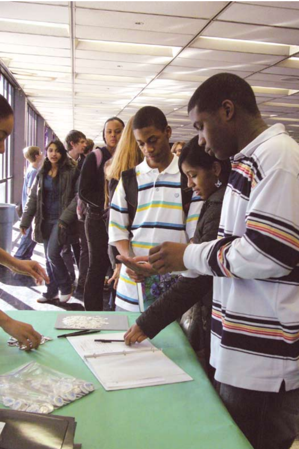
Students at Whitney Young High School participate in a GO TO 2040 "Bold Ideas" event to help envision a brighter future for the region.