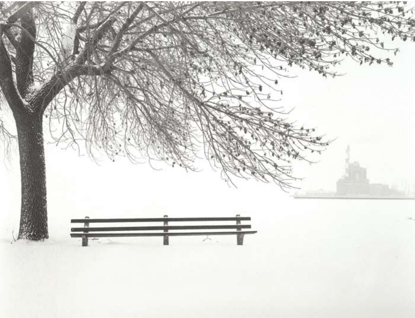
Overall Winner, " Images of Northeastern Illinois " photography contest