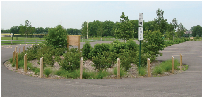
Implementing green infrastructure projects.

From a policy standpoint, a county-level utility may help reduce concerns that the playing field for development is uneven because of varying fees between municipalities. (While property owners would be responsible for paying the fee, not developers, the fee would to some extent affect the price at which a developer could sell a property.) A tradeoff is also present in the use of funds. Pooling funds for larger projects selected at the county or watershed scale would likely lead to projects with larger benefits relative to their costs, but there may not be perfect proportionality between the jurisdictions providing fee revenue and those benefiting from projects. On the other hand, municipal land use regulations (such as parking ratios, height and bulk requirements, etc.) play a significant role in setting the level of imperviousness on private property. A fee charged at the county level may be disconnected from these municipal decisions.