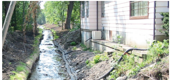
Stabilizing streams and other stream restoration projects.