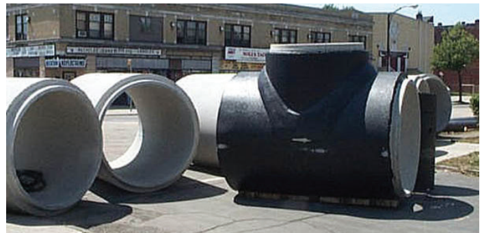
Installing storm sewers.