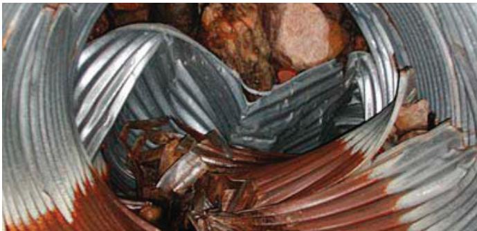
Replacing failing culverts.

A county-level utility would have some practical advantages. Economies of scale are possible by having a larger agency handle acquisition and analysis of impervious cover data. In fact, some municipalities do not have GIS capabilities sufficient to handle that aspect of stormwater fee administration (although they could contract for that service). Because of their role in property tax assessment and maintaining property records, the counties generally have sophisticated GIS capabilities. On the other hand, most municipalities already have water and sewer utility billing systems set up for their residents while counties generally do not. Stormwater fees are often added onto water/sewer bills rather than mailing separate bills.