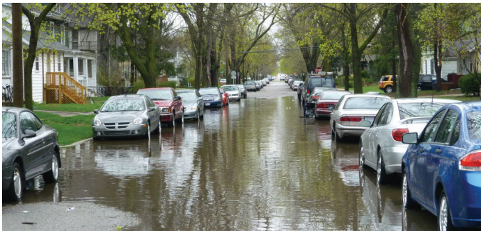
Addressing street flooding.