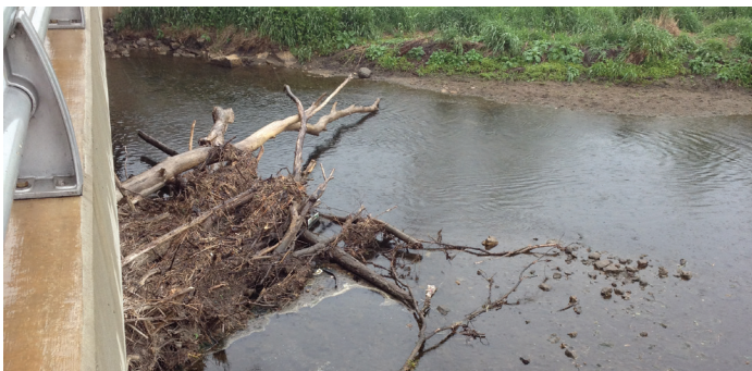
Removing debris from streams.