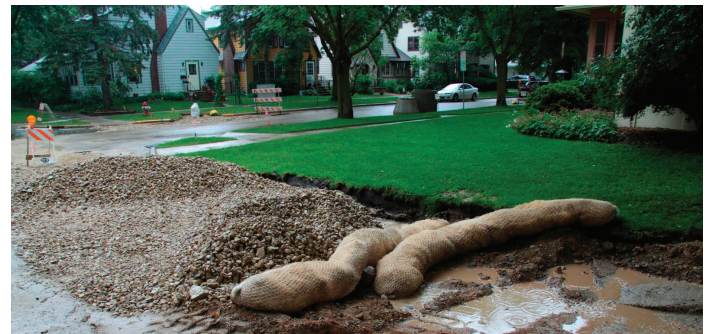
Upgrading local drainage.