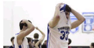
WARRIORS FALL IN UPSET» Stunned by Chicagoland Jewish