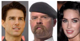
LOOK LIKE A CELEBRITY?» Send us your photo»