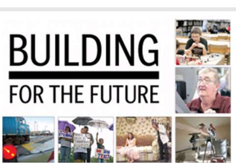
"My McHenry County: Building for the Future," a special Northwest Herald report