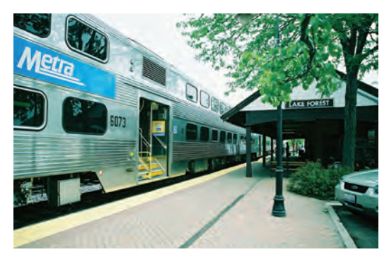
The TMA of Lake Cook has focused corporate leadership on providing alternative travel options for the TMA's member employers, including expanded city-to-suburb and suburb-to-suburb commuter rail and a national-model "Shuttle Bug" service from commuter rail stations to employment sites. The shuttle service grew from 110 daily trips when it began in 1996 to 1,300 daily trips today.

In fact, counties have begun to explore that relationship in order to promote fitness for residents as part of their planning efforts as well as project implementation. County planning can establish land use and transportation policies that help increase physical activity. Related to their role in protecting public health by promoting active lifestyles, counties may also encourage a "complete streets" approach to roadway design, making sure that needs of pedestrians and bicyclists are accommodated. Counties also can take a leadership role in providing both on-street and off-street bicycle facilities and encouraging connections between municipal bicycle systems.