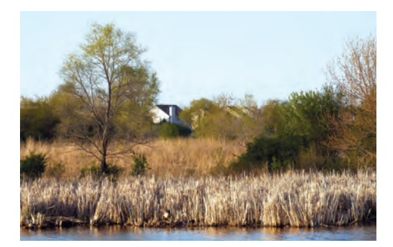
McHenry County instituted conservation design requirements in its subdivision code that go into effect when there are important natural resources on a development site.

County comprehensive plans and programs can address water supply and demand management. This has become an increasingly important issue because groundwater levels in aquifers serving outlying counties have been declining and in some cases are showing higher concentrations of chemicals like barium and radium. CMAP's Water 2050 report recommends that county governments protect groundwater by taking aquifer recharge areas into account in comprehensive planning, and developing ordinances to regulate land use in recharge areas, among other actions. Although they do not often operate water utilities, counties can administer or help implement many water conservation best management practices, such as appliance and water fixture rebates or providing a conservation coordinator.