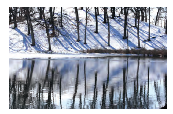
McHenry County Water Resources, along with the Natural Resource Conservation Service, developed a map of Sensitive Aquifer Recharge Areas (SARAs) and has been working to integrate it into comprehensive plan recommendations. While its methodology is oriented toward the sand and gravel aquifers of the county, a similar method could be used elsewhere.