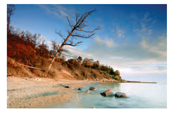
On November 4, 2008, voters in Lake County approved a $185 million referendum with 66 percent of the vote for the Lake County Forest Preserves to acquire and improve land to protect wildlife habitats, conduct ecosystem restoration, and to provide flood control and recreation. Certain properties that the Forest Preserves had been targeting for years were in danger of being sold for other purposes. Of the funds, $148 million will be used for land acquisition purposes. It is estimated the referendum funds may establish 3,000 acres of preserves.