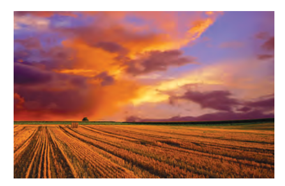
A strong and successful farmland preservation program in the region is that of Kane County, which has a purchase of development rights program funded through taxes on casino receipts. The program is used to ensure that farmland will not be converted to another use by a future owner.

Counties are largely responsible for public health , and can use this expertise to link the features of livable communities with positive health outcomes. Besides this role, counties can play a significant part in coordinating human service programs, which are often carried out by a variety of organizations and different levels of government. An important way to do so is by participating in a 211 system (modeled on the 911 system) that provides callers with information and referrals about human services and related community information. Counties typically distribute Community Development Block Grant (CDBG) funding, coordinate energy assistance programs, and have a number of other responsibilities. The central role of the counties in providing human services gives them the ability to help convene service providers and funders to ensure that needs are being addressed appropriately.