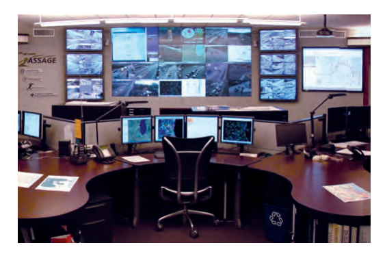
Lake County's "Program for Arterial Signal Synchronization and Travel Guidance" (PASSAGE) gives motorists real-time information about traffic bottlenecks via electronic signs or an AM radio station. Based on the same information collected by cameras and traffic sensors, operators can also adjust traffic signal timing to reduce congestion buildup. This still-expanding ITS system is a model for other counties.