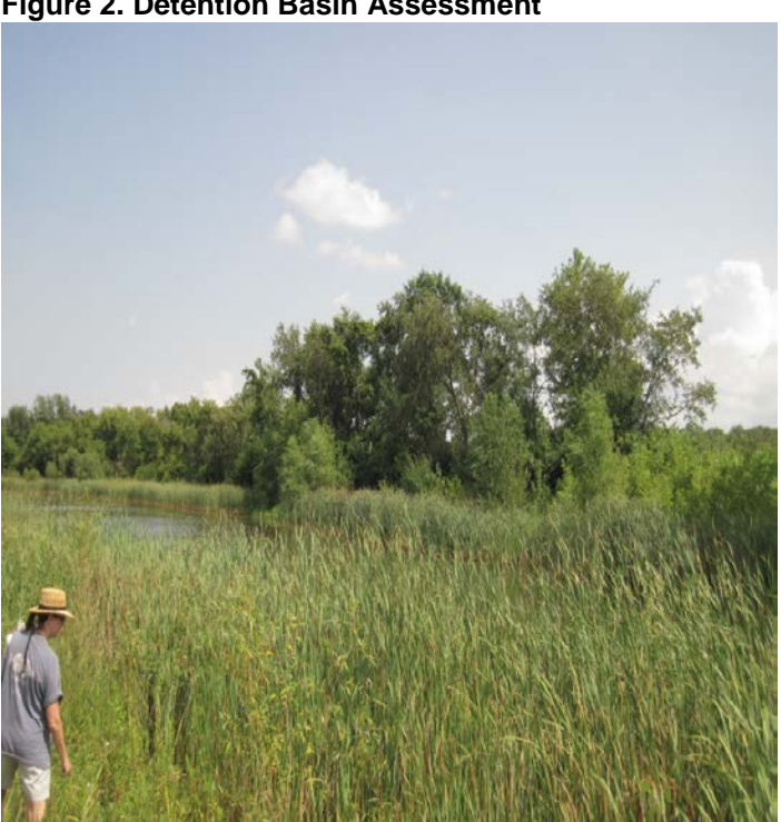
Figure 2. Detention Basin Assessment

Assessing detention basins for their degree of water quality benefits and retrofit opportunities is part of the watershed resource inventory.