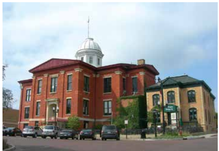
Old Court House Art Center, Woodstock, Illinois.

For more information: oldcourthouseartscenter.com