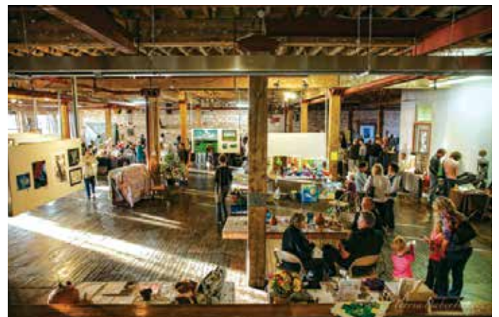
Historical photograph and present-day, Starline Factory, Harvard, Illinois.