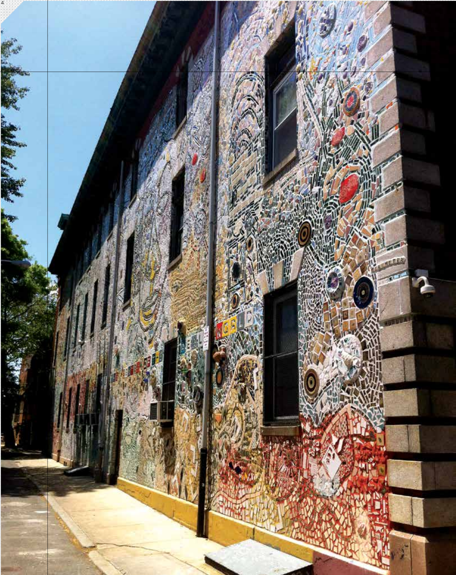
Mosaic mural, Philadelphia, Pennsylvania.