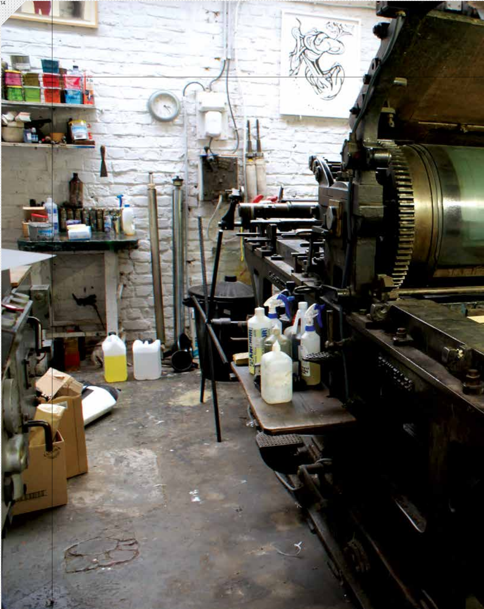
Bruno Robbe studio, Frameries, Belgium.