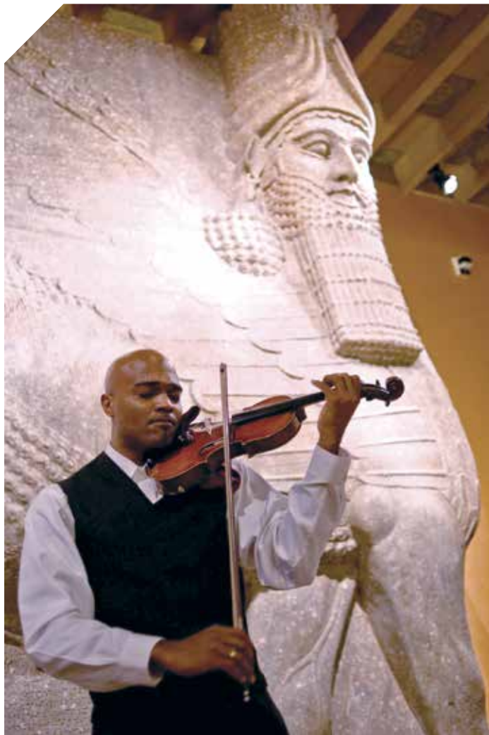
Hyde Park Jazz Festival, Oriental Institute, Chicago, Illinois.

At this point in the process, there should be a definition for arts and culture, a tally of existing community assets, initial goals, and a clear vision to measure success. A clear public participation program will then assist in refining each of these. Public participation efforts should reach out to the broader community in order to establish a base of participation and input that is representative of the arts and culture community, as well as to ensure that the goals and vision developed during the preparation component are valid, supported, and achievable. Participation and input are critical components of the planning process, and all decisions made to this point, as well as the inventory of existing assets, should be vetted and reinforced or refined based upon input received from key stakeholders.