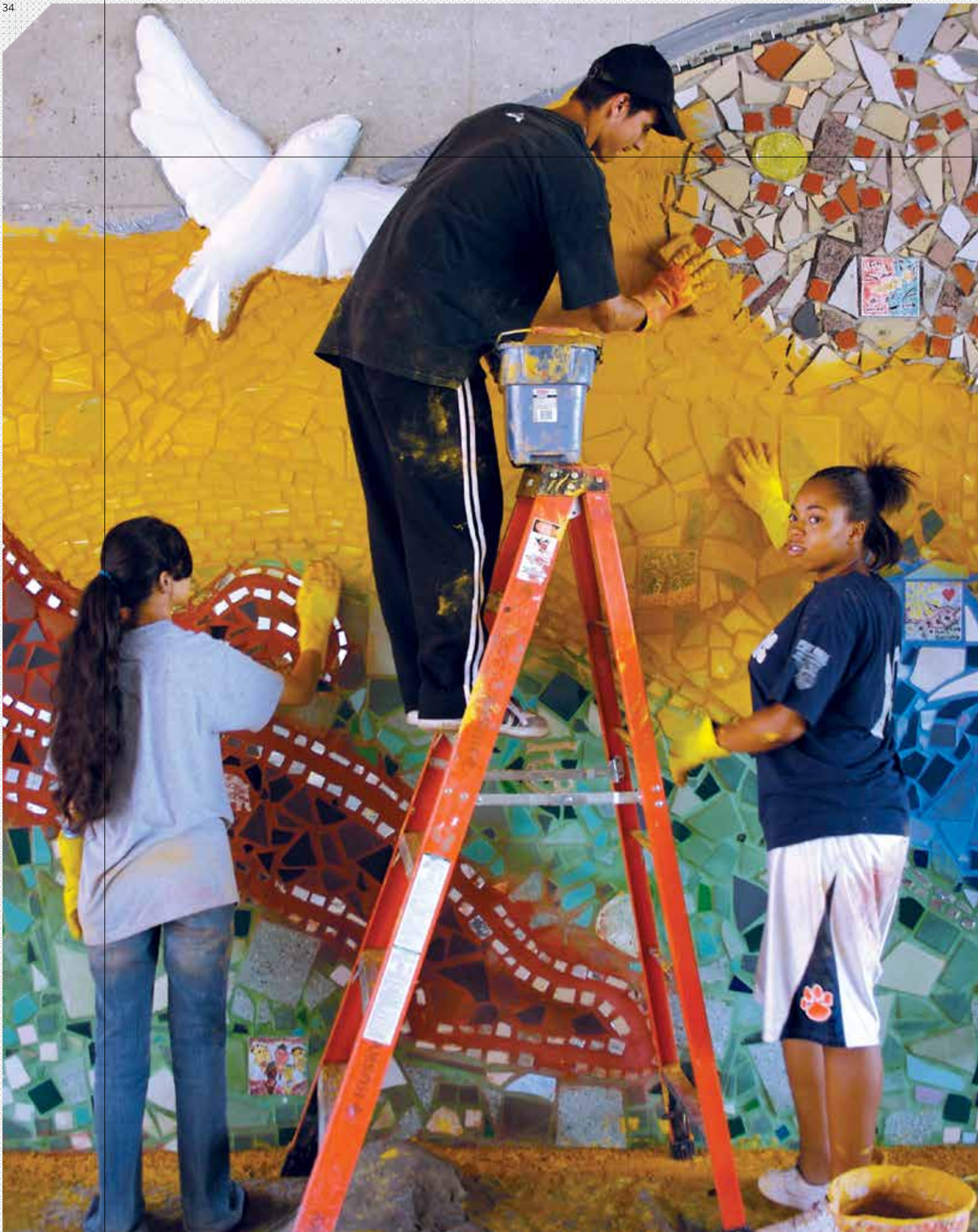
Bryn Mawr Avenue underpass bricolage Living 2007, Chicago, Illinois.