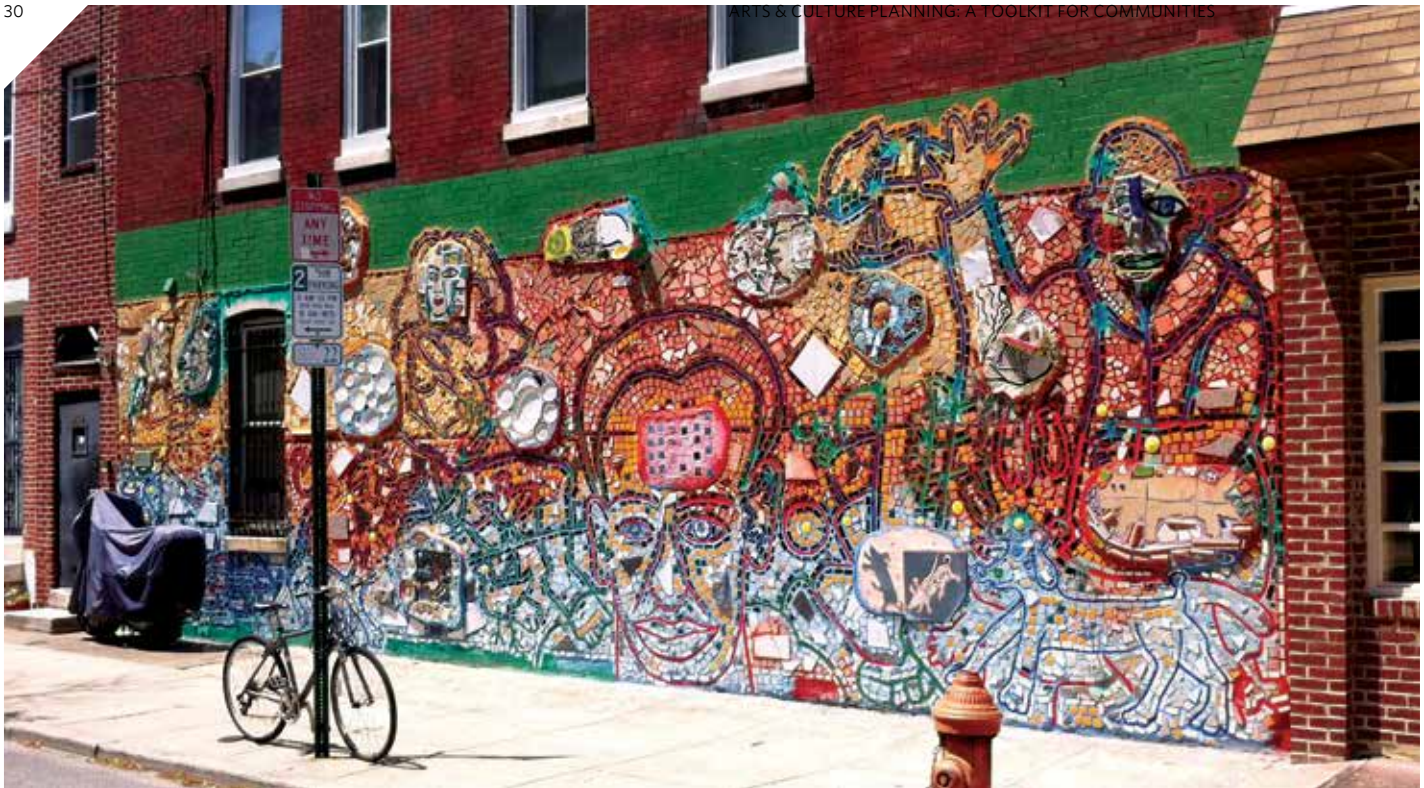
Mosaic mural, Philadelphia, Pennsylvania.