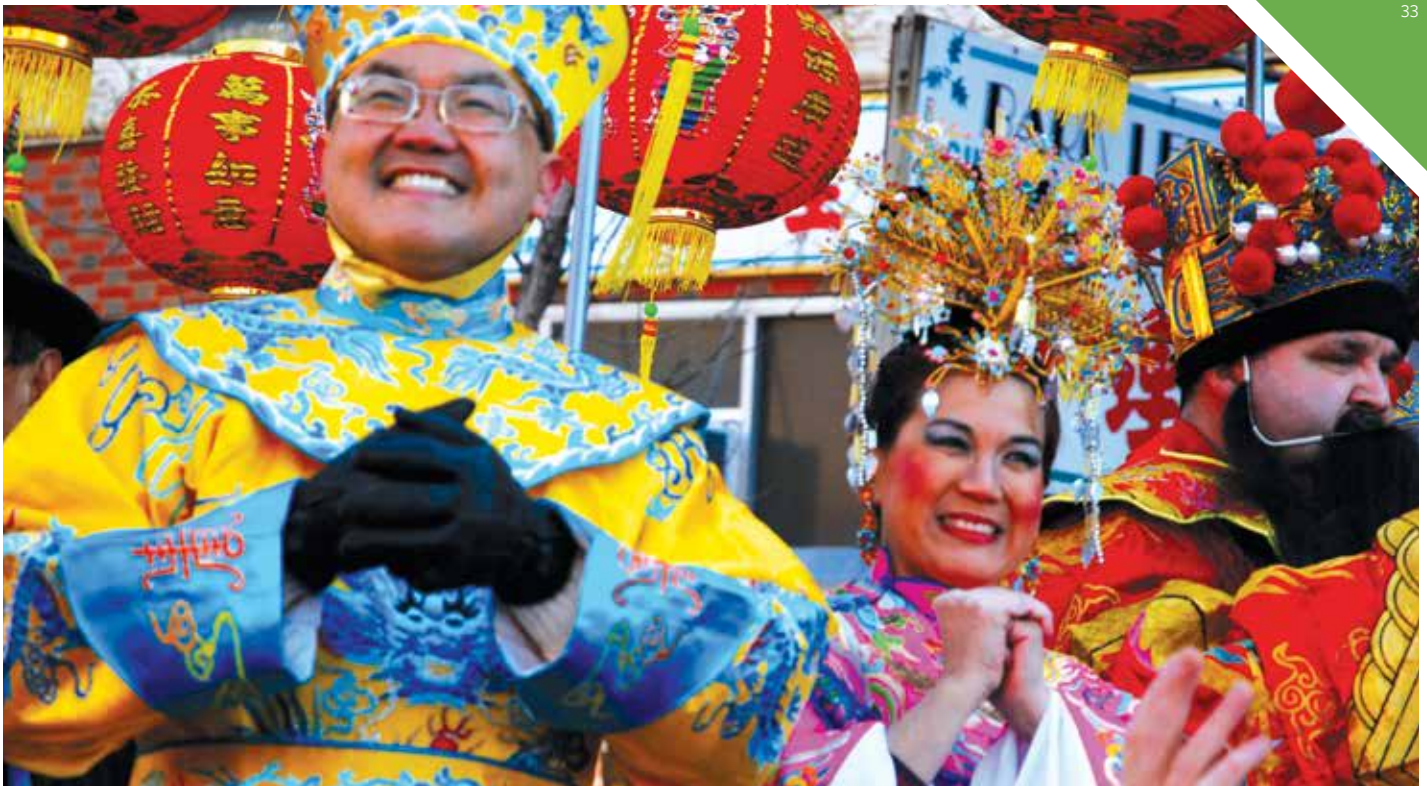
Chinese New Year parade, Chicago, Illinois.