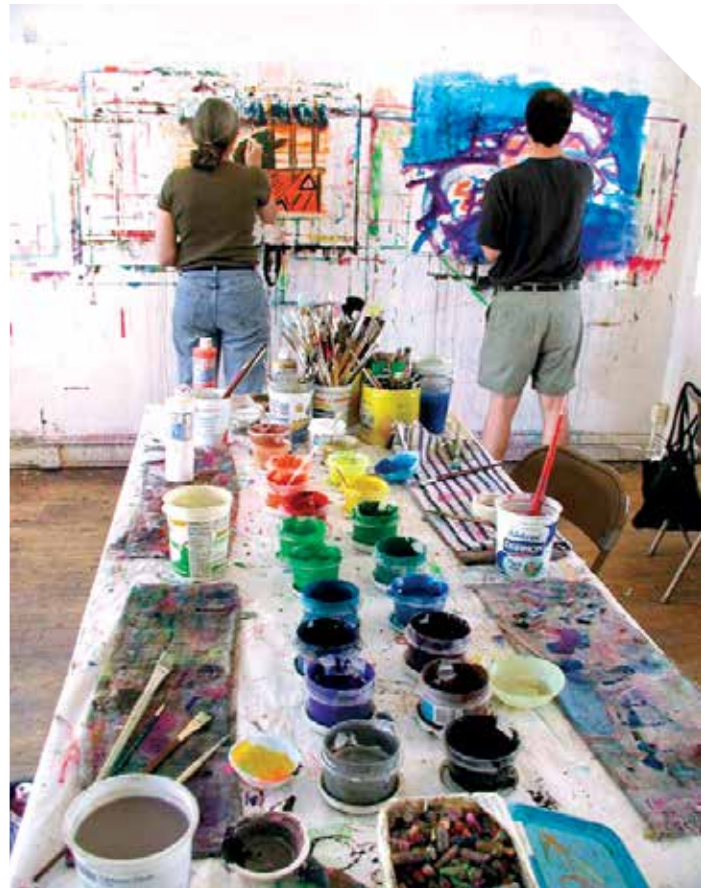
One-day workshop, Open Studio Project, Evanston, Illinois.

More specifically, incorporating arts and culture into a comprehensive plan can be accomplished in one of two ways. The plan can create a section that specifically targets arts and culture within the community, as done with sections reserved for housing or economic development. In this approach, arts and culture policies are detailed, typically address a wide range of issues, and involve specific implementation actions. An alternate approach is to weave arts and culture policies throughout the various topic areas where they would support and benefit other policies. For example, if a comprehensive plan includes policies to create a downtown identity, public art may play a role in that. In another example, if the plan looks at social issues, such as youth programs, policies to implement arts education programming may be included.