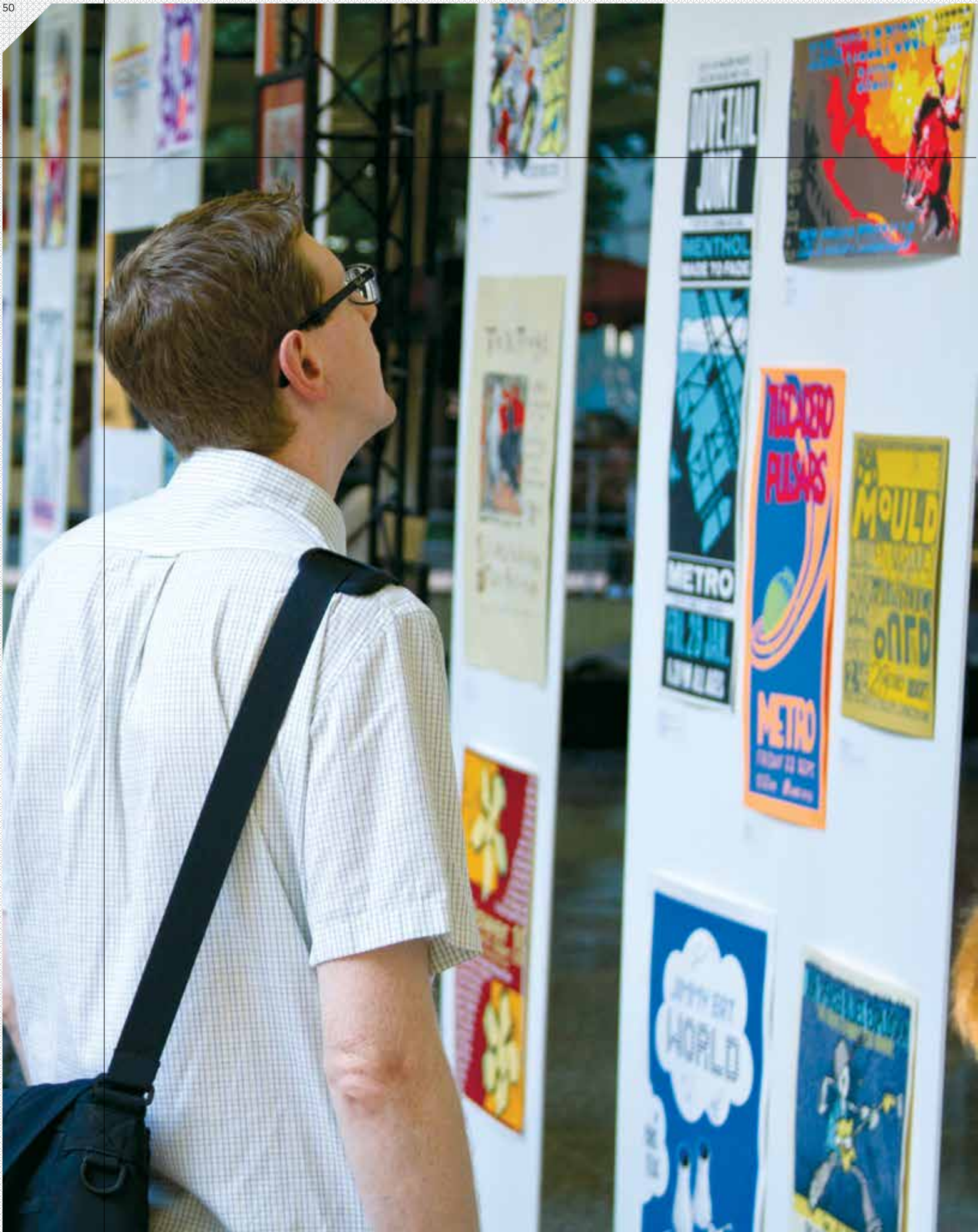
First Thursdays gallery walk, Pop-Up Art Loop at the Inland Steel Building, Chicago, Illinois.