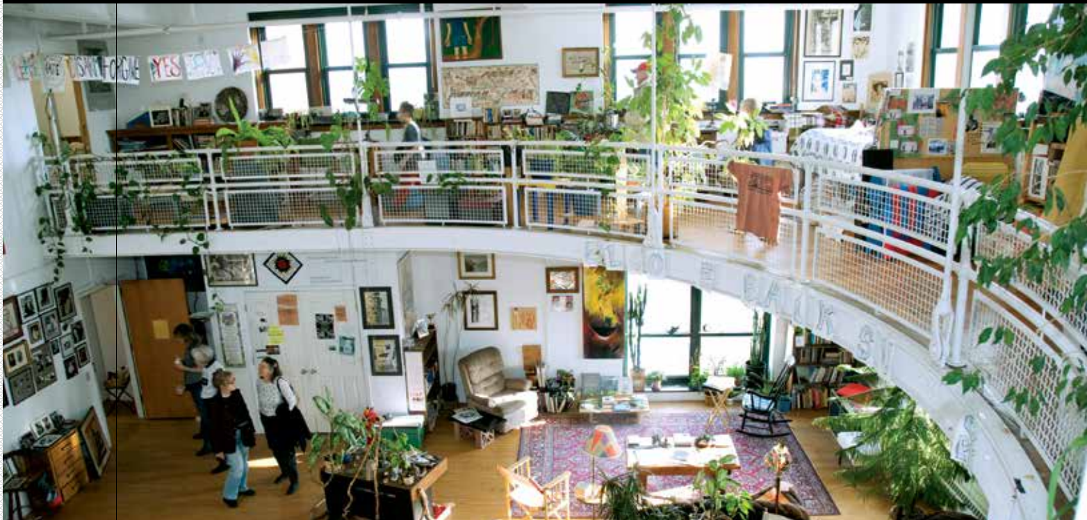
Before and after renovation of Washington Junior High School into Washington Studios artist live/work space (an Artspace project), Duluth, Minnesota.