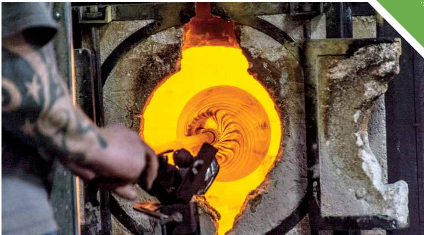
Glass blowing, Harmony, California.