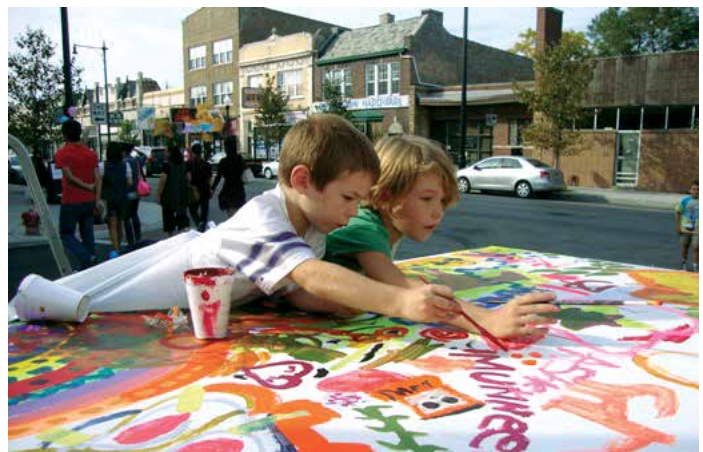
NRC neighborhood cultural festival, Chicago, Illinois.

For more information: northrivercommission.org