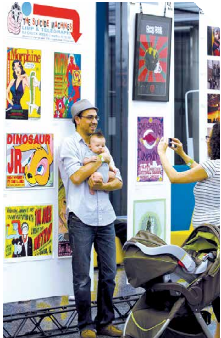
First Thursdays gallery walk, Pop-Up Art Loop at the Inland Steel Building, Chicago, Illinois.

These questions can help to identify resources that are critical to an arts and cultural identity, yet may be rarely thought of as traditional arts and culture resources.