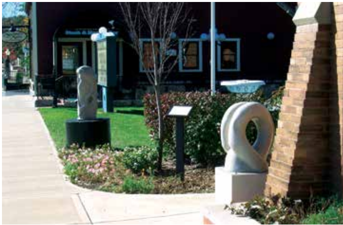
Public art, Algonquin, Illinois.

algonquin.org/departments/board.php?fDD=7-20