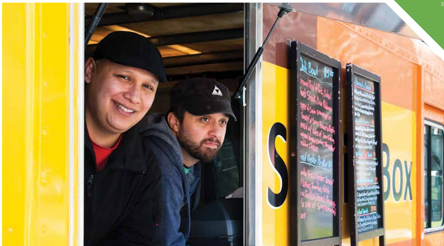
"SamichBox" food truck, Chicago, Illinois.