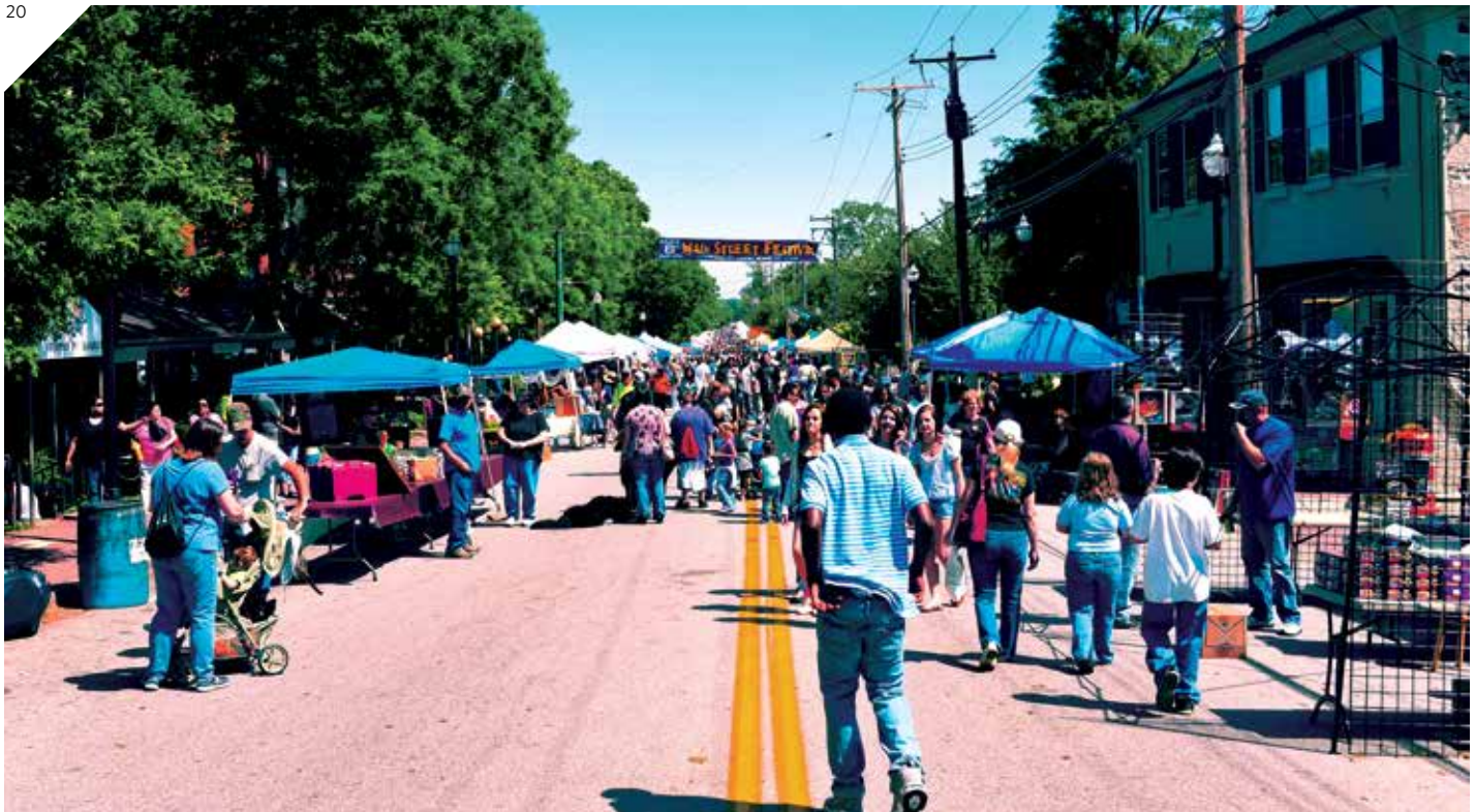
Laurel Main Street Festival, Laurel, Maryland.