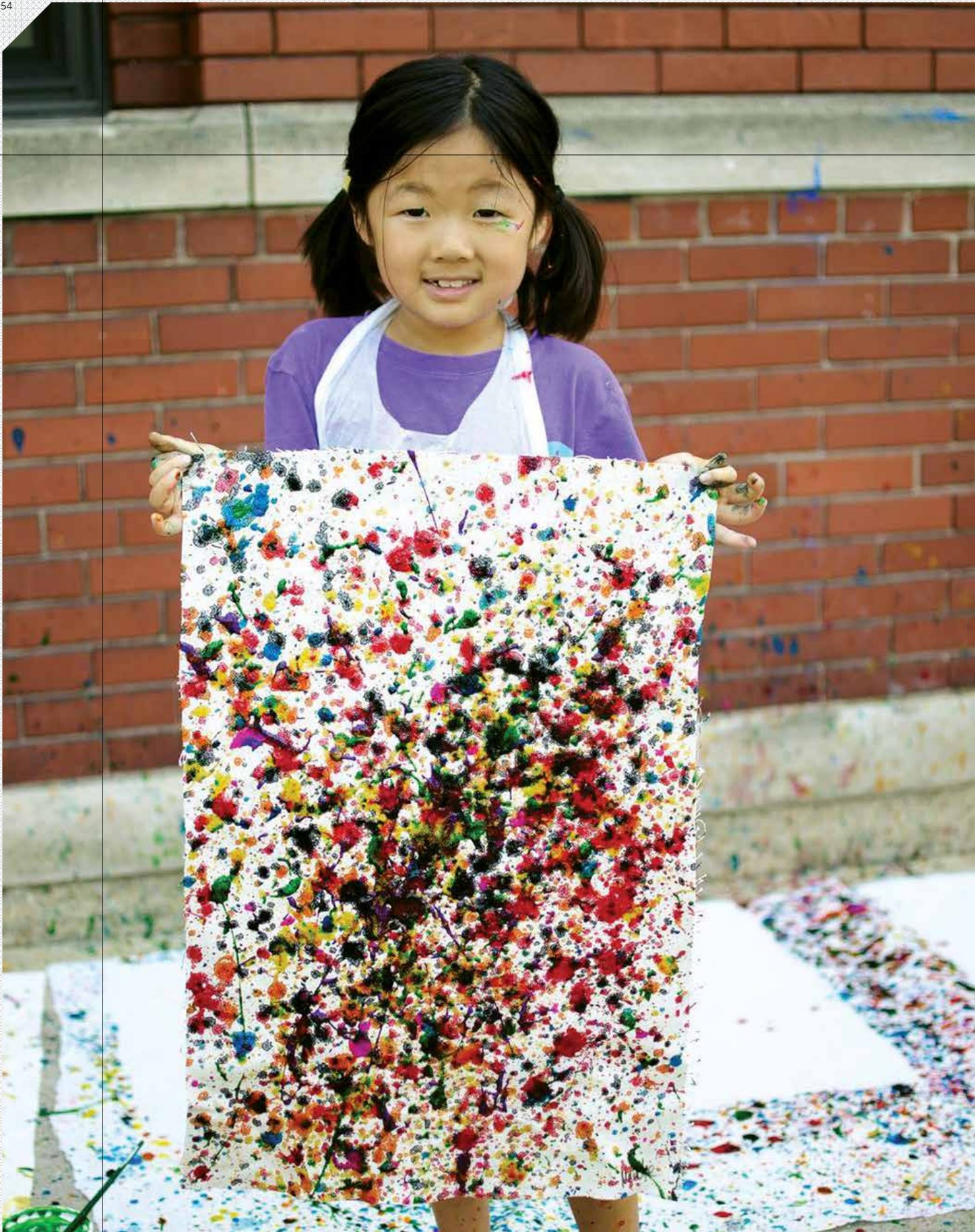
Kids arts class, Lillstreet Art Center, Chicago, Illinois.