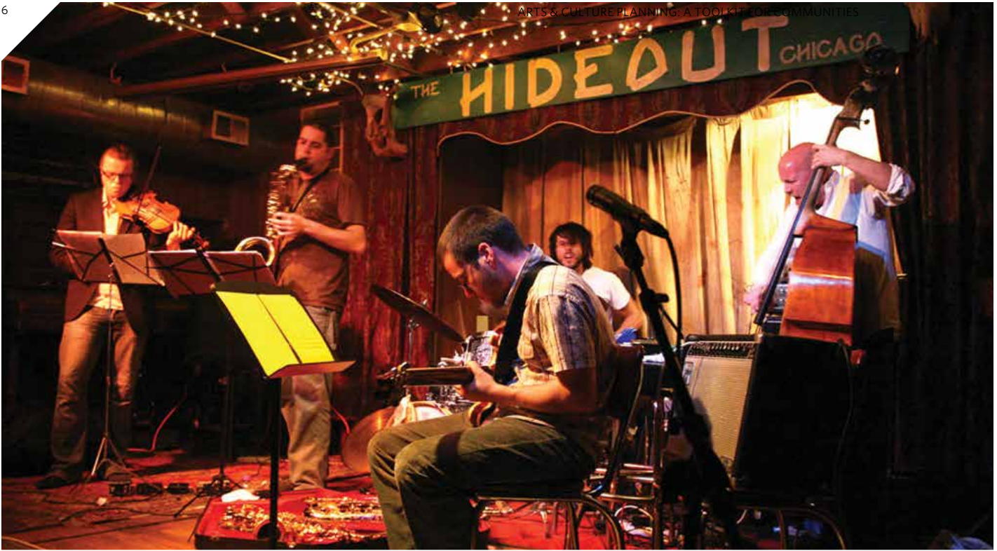
Umbrella Music Festival, Hideout, Chicago, Illinois.