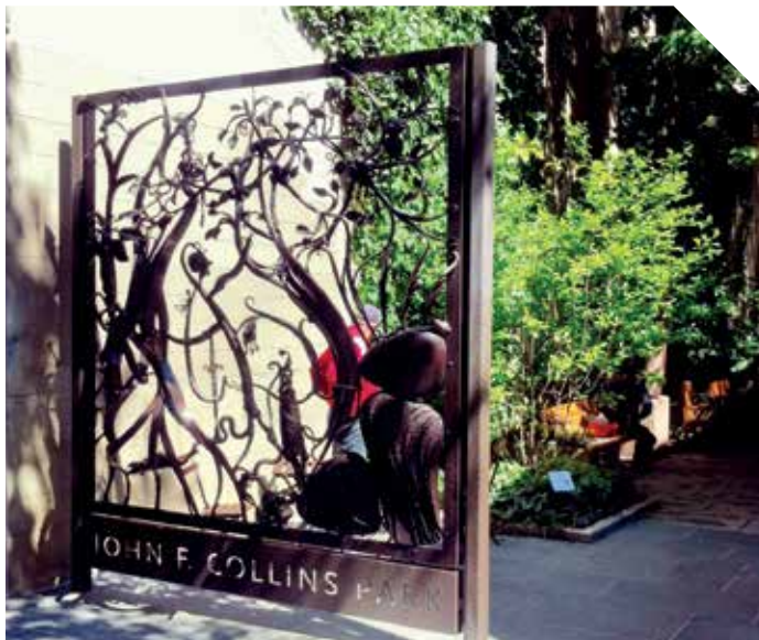
Gate, John F. Collins Park, Philadelphia, Pennsylvania.

Partnerships can be critical to the planning process and often create pathways to achieving success through cooperation, as is demonstrated in a number of the case studies found in Section 5 of this document. Therefore, it is critical to consider a range of partnerships throughout the planning process for a variety of reasons. If interested partners come forward, consider letting them contribute to the process in whatever way they may be able to help. Maintaining focus and keeping an eye toward accomplishing the goals established at the outset of the process is critical. However, it is also important to remember that allowing contributions from a range of stakeholders and partners will increase community ownership over the process in the long-term.