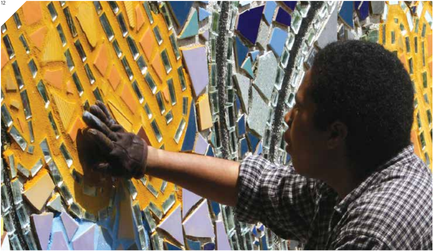
Foster Avenue underpass bricolage Indian Land Dancing, Chicago, Illinois.