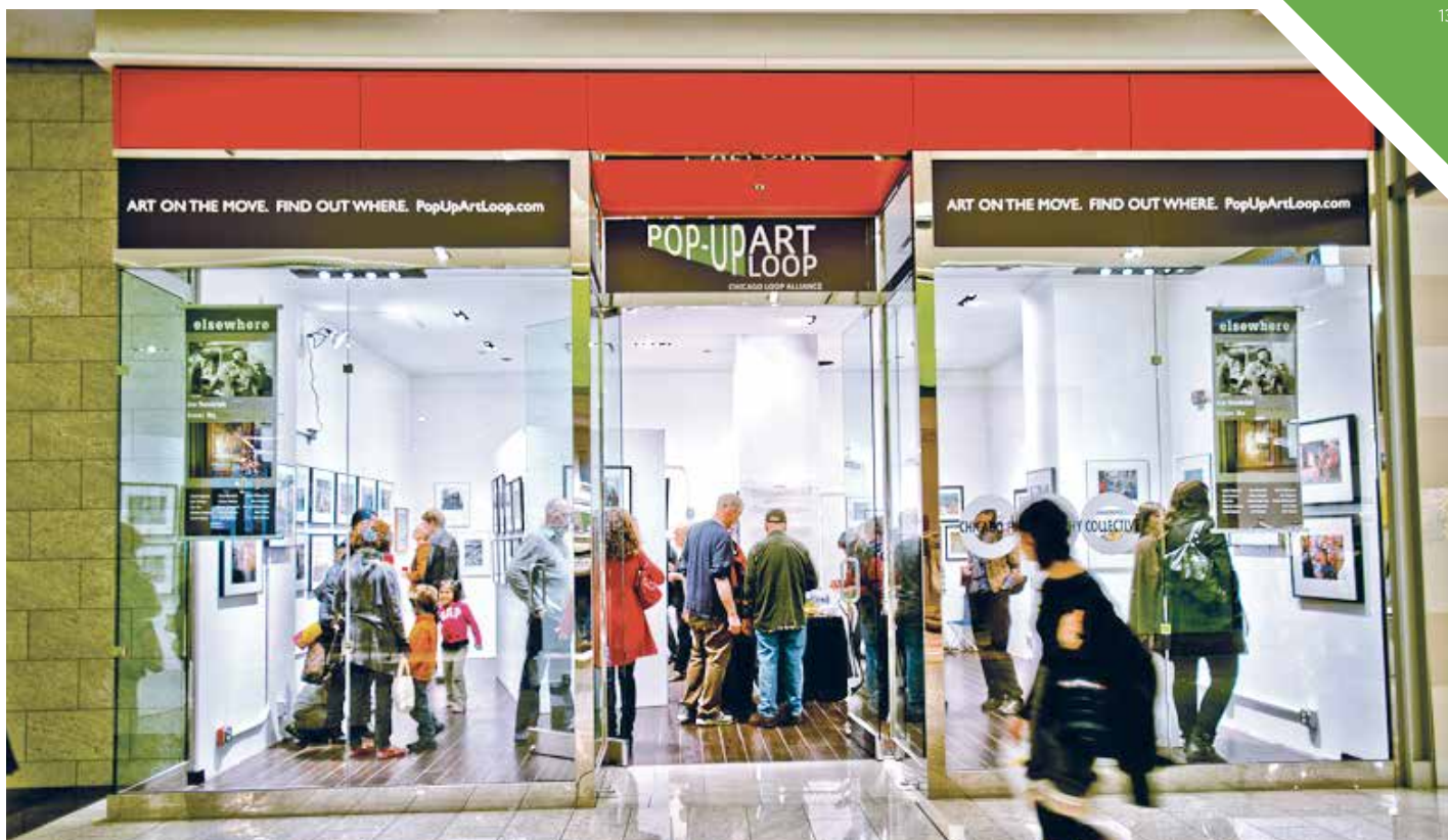
First Thursdays gallery walk, Pop-Up Art Loop at Block 37, Chicago, Illinois.