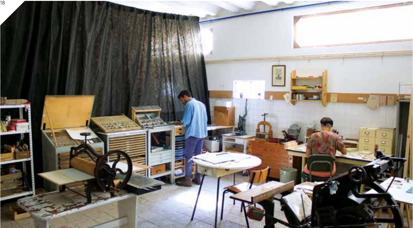
Maker space, Caldas da Rainha, Portugal.