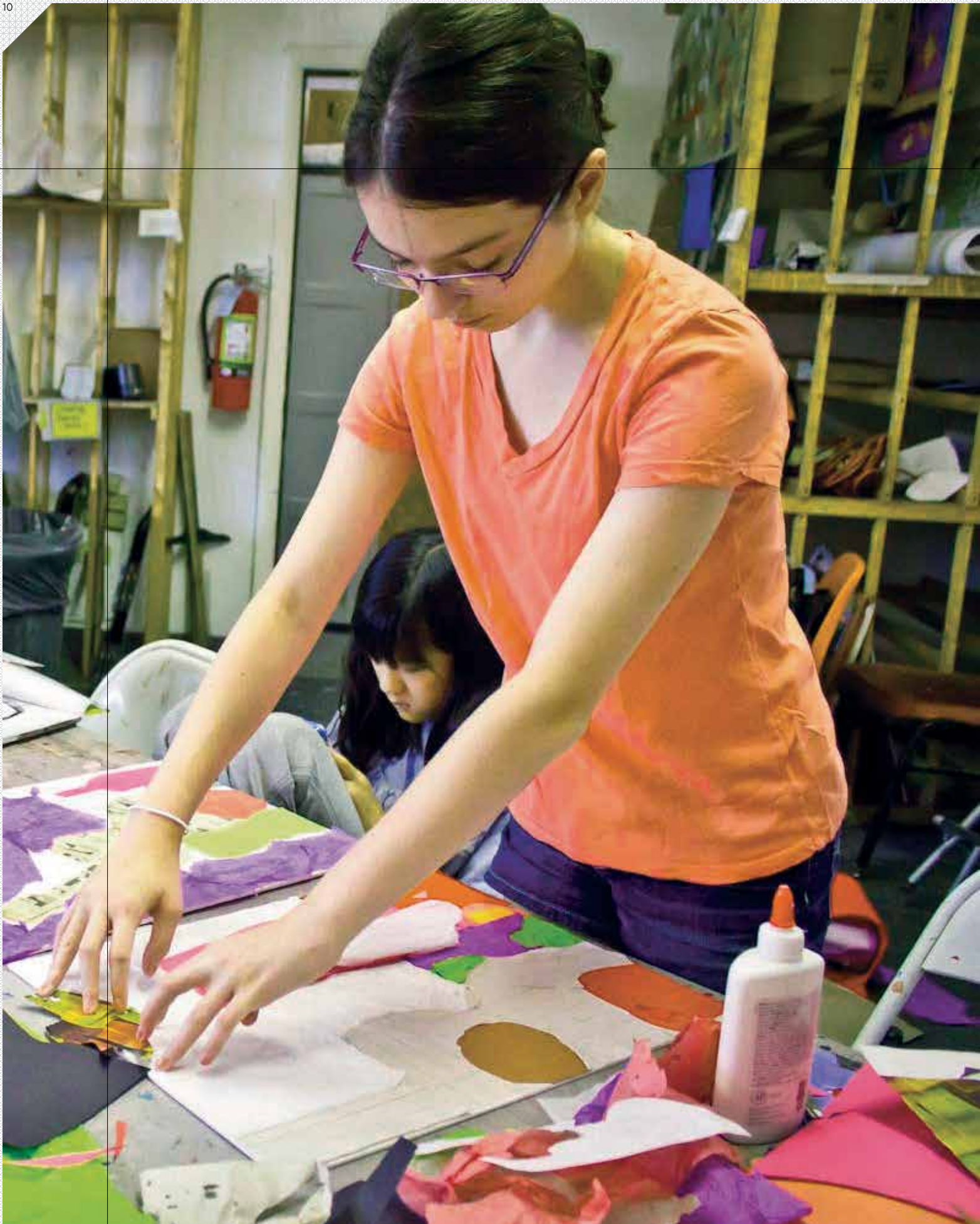
Kids arts class, Lillstreet Art Center, Chicago, Illinois.