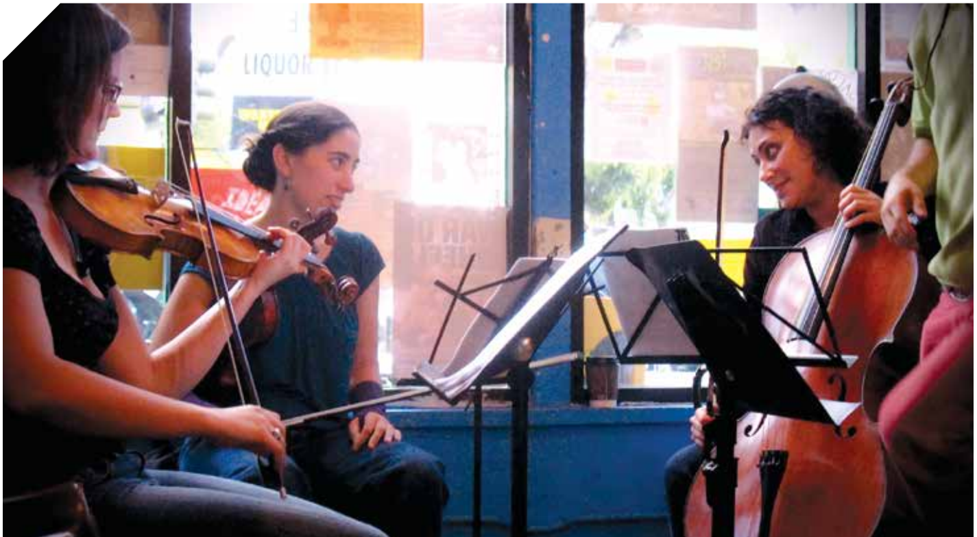
New Pantheon Quartet, San Francisco, California.