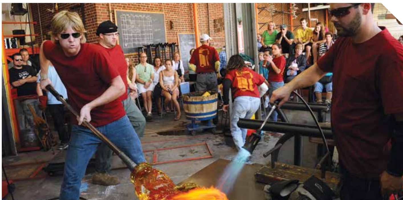
Glass blowing, New Orleans, Louisiana.

The decisions made during the act of defining arts and culture within the community are critical, as they help to narrow the community's focus in terms of what is considered policy relevant when it comes to arts and culture.