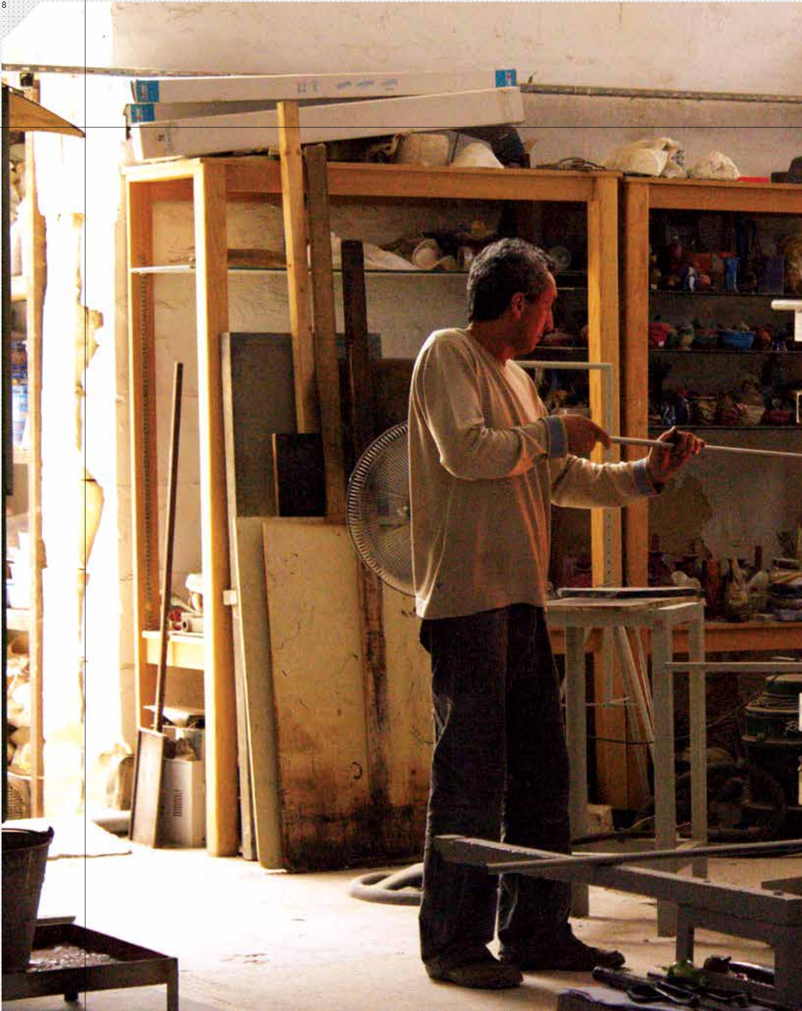
Glass blowing, Malta Majjistral, Malta.