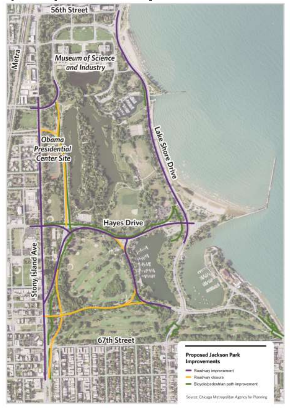
Figure 1. Proposed Jackson Park Improvements

connectivity, and increasing green space. In another related improvement, Metra will expand its reconstruction of the 59<sup>th</sup> Street Metra Electric station to accommodate additional traffic and reopen a long-closed entrance on 60<sup>th</sup> Street.