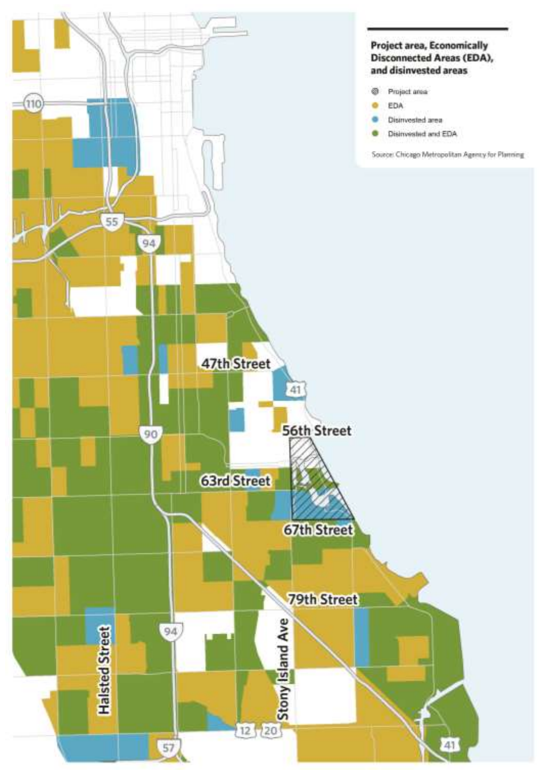
Figure 2. The Jackson Park Project area, economically disconnected areas, and disinvested areas

Jackson Park is located in the Woodlawn Community area, and it is also adjacent to the Hyde Park and South Shore Community areas. This area is particularly relevant to the inclusive