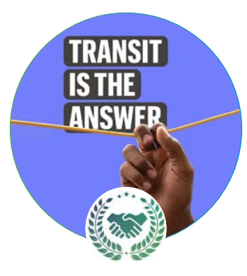
Partners for Progress