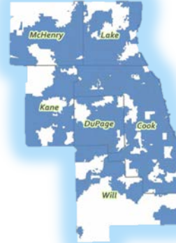
Dispersion of Survey Respondents

As a first step to updating the region's Transit Strategic Plan (Moving Beyond Congestion), the RTA conducted an online survey to gather input on the current plan's Vision and Goals. The survey was launched on December 19, 2012 and closed on January 31, 2013. The RTA received over 1,500 responses from members of the general public, stakeholders and elected officials. We were pleased with the breadth of representation in these responses. Overall, the results of the survey did not support a wholesale revision of the Plan's vision and goals, but did support 1) a more succinct vision statement; and 2) goals that would bring greater definition to the vision and that are more reflective of customer needs and wishes.