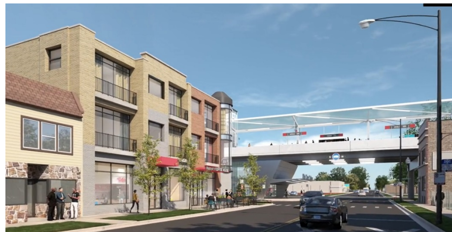
Conceptual renderings of 103 rd Street Station