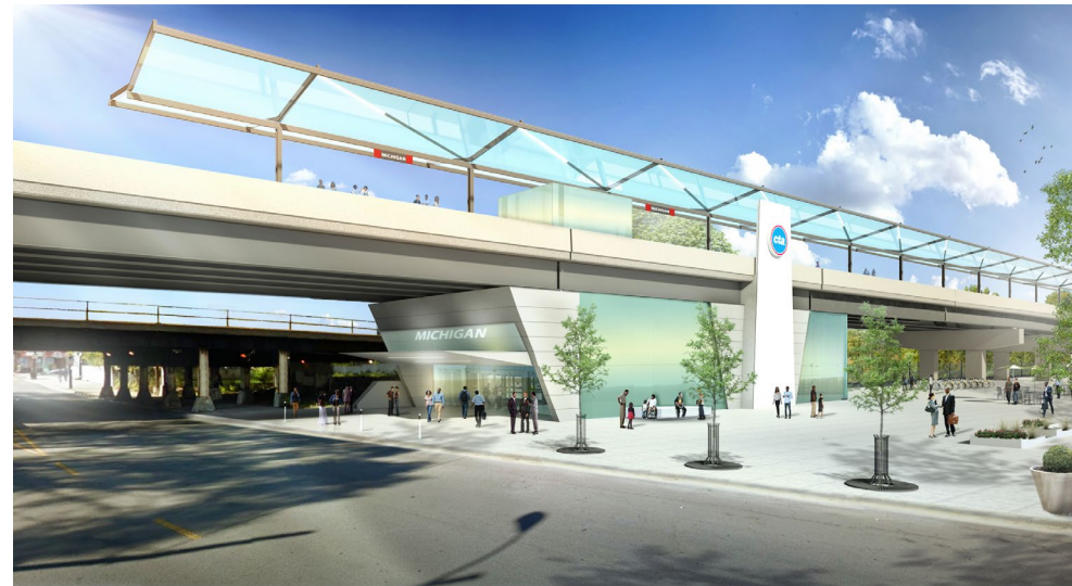
Michigan & 116th Station Conceptual Rendering