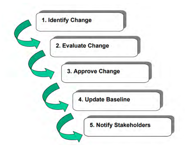
Step 1: Identify Change

ITS Architecture changes occur primarily as a result of stakeholder changes or ITS projects being added, deleted, modified, or reprioritized. Other changes result from adjustments in regional needs or change in the National Reference ITS Architecture, referred to as the Architecture Reference for Cooperative and Intelligent Transportation (ARC-IT)<sup>2</sup>. It has been most productive to focus on changes needed in response to ITS project changes. Discussion of the project changes lead to identification of new projects, items needed for the project which must be added to the stakeholder inventory, and new agreements that may be needed to support the project.