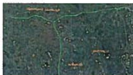
Basic corridor map for proposed Highway 53/120 extension.