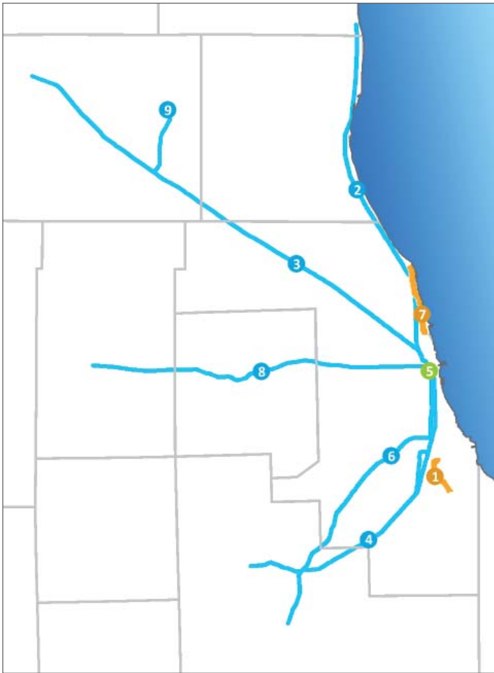
GO TO 2040 Fiscally Constrained Transit Projects