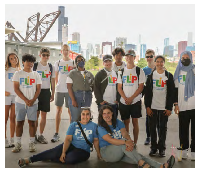
Future Leaders In Planning (FLIP) 2022