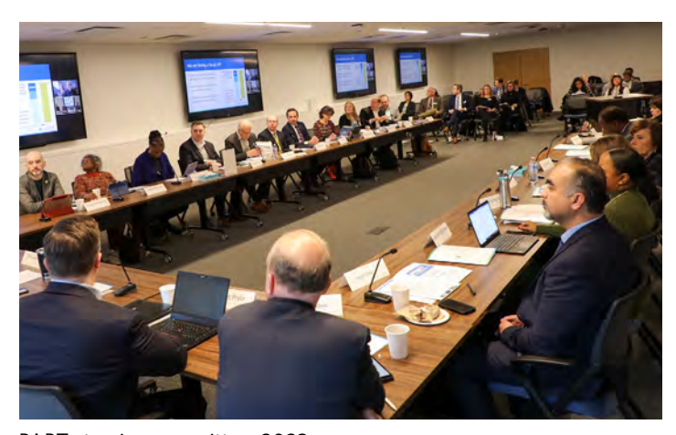
PART steering committee, 2023

The Mobility Recovery report, released in fall 2022, includes recommendations to strengthen the region's transportation system so that it works better for everyone, including improving transit, reducing congestion, and addressing travel safety.