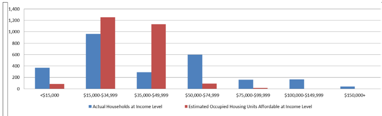
Figure 1. Smallville comparison of rental household incomes with occupied units affordable at each income level