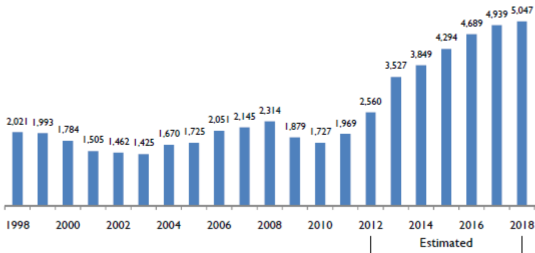
Figure 3. Maintenance backlog on state highway network