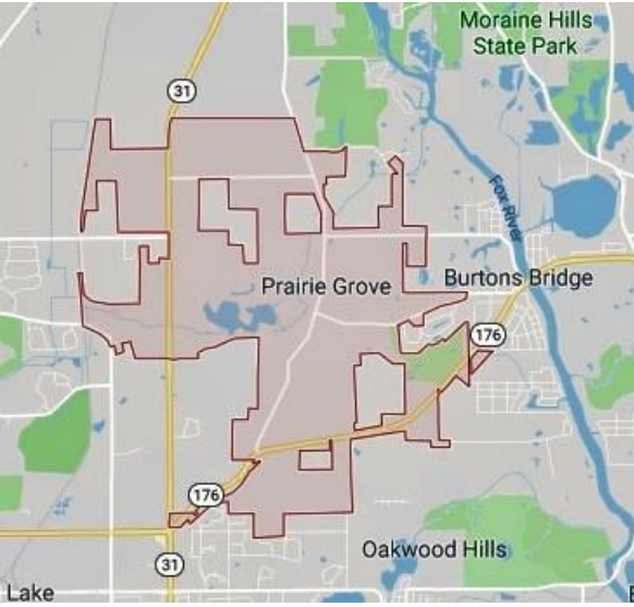
Village of Prairie Grove

Village of Prairie grove Comprehensive Plan https://www.prairiegrove.org/wp-content/uploads/2017/08/PGCompPlan_rev0207.pdf