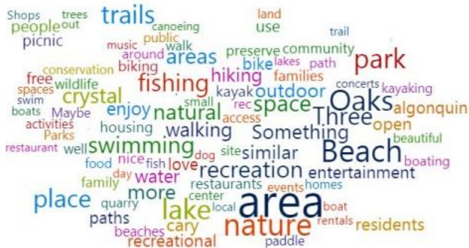
Figure 3. Common words used to describe vision for subarea

The final question of the survey was open-ended and asked participants for their personal vision for the subarea. 510 participants left comments. There were frequent mentions of Three Oaks Recreation Area in Crystal Lake – many respondents view it positively and would like to see something similar in Algonquin or Cary without the fees they pay in Crystal Lake. Alternatively, others favor quieter, more passive recreation opportunities and restored open space. The comments received are represented visually below.