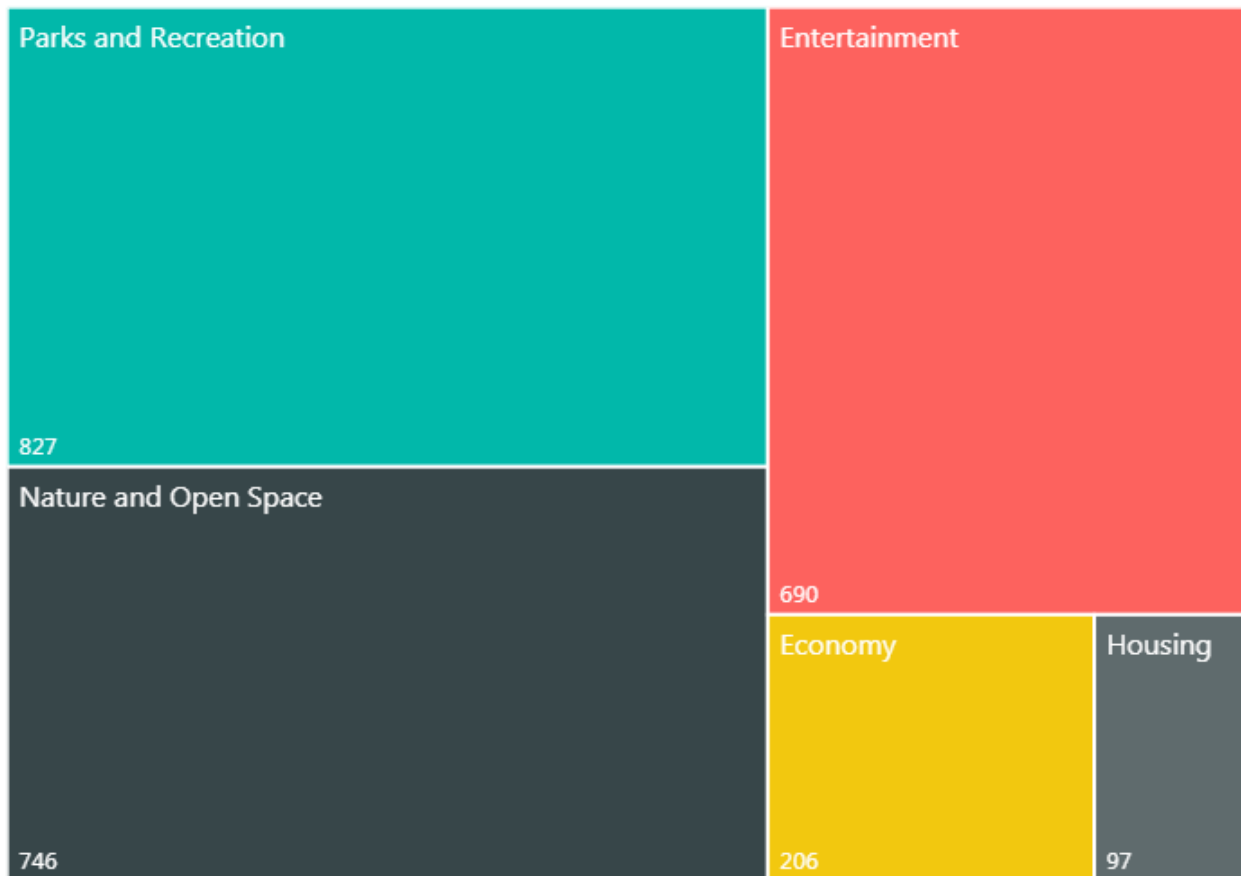
Figure 1. Theme ranking

Participants then ranked corresponding strategies to implement the themes they identified in the prior step. Strategies such as trail connections, boardwalk viewpoints, canoeing/kayaking, restoration and preservation, beaches, and a swimming area all ranked very highly. Additionally, eating/drinking businesses was the highest rated strategy outside of the 'Parks and Recreation' and 'Nature and Open Space' categories.